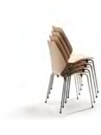
City Original stacks 11 pcs.