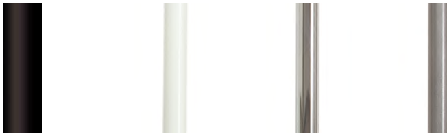
Black epoxy (RAL 9005)