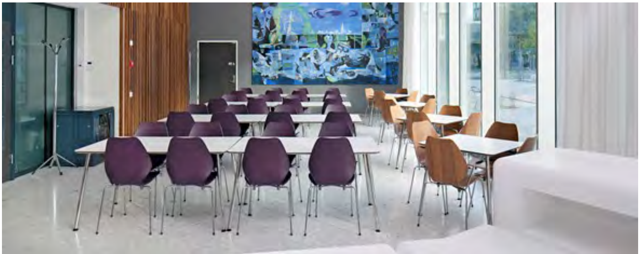
The canteen at St Olav's knowledge center.