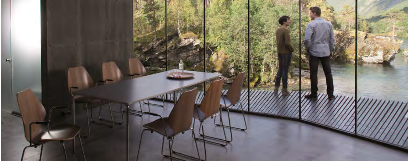
City Original and Clip table.