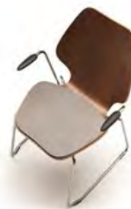
Seat cushions in microfiber or wool