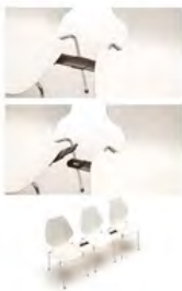
City with linking device