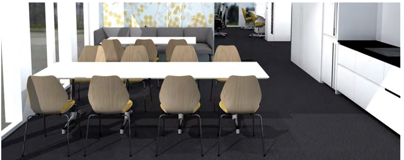
A canteen with Next tables and chairs Original City.