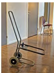
Chair trolley to the City chairs.