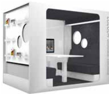
Cocoon Working-Lounge Exclusive

Create a zone for students and work groups with the Cocoon Working-Lounge.