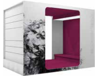
Cocoon Kids-Lounge XL