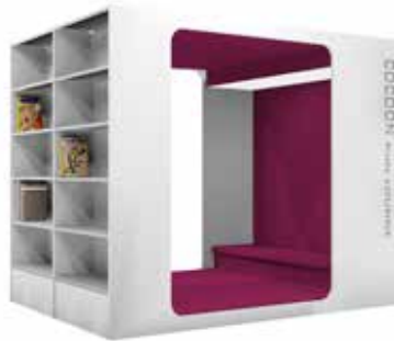
Cocoon Kids-Lounge L

Two models are available - L and XL - depending on if seating is required in both sides of the Lounge. Add graphics to the sides of the Lounge to create just the right atmosphere.