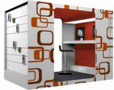
Cocoon Computer-Lounge XL