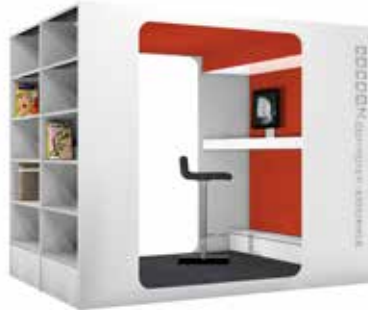
Cocoon Computer-Lounge L

Depending on choice of model, you can use the exterior surfaces for display on the high gloss display panel or steel shelves. You can also install browsers and many other function from the Ratio shelving system for both storage and display in the module with two bays.