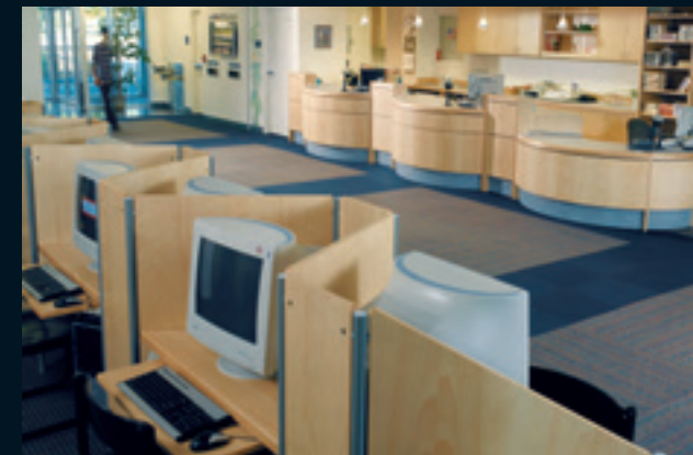
La Grange Park Public Library, Illinois, Classic desk and Study tables.