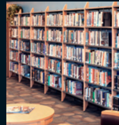
Teaneck High School, New Jersey. Exposé shelving