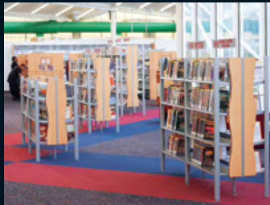
Michigan City Public Library, Indiana. Metis shelving system and Tricolore Children's shelving system.