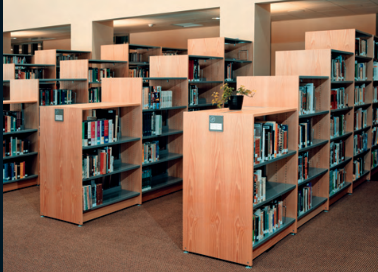
North Haven High School, Connecticut. Oslo shelving system.