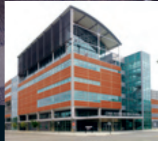
Cass Tech High School, Michigan. Opal mobile shelving system.