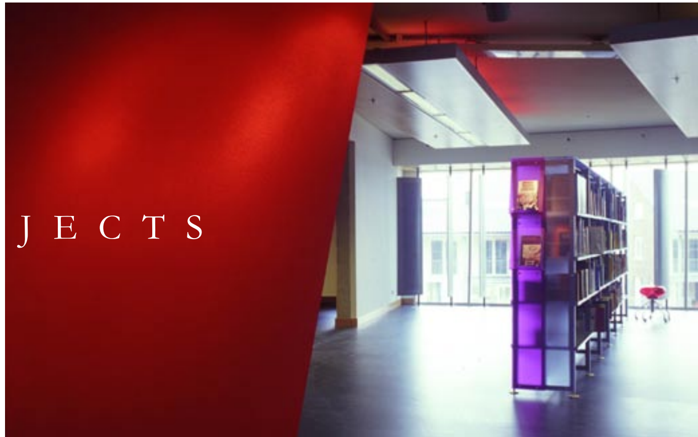
Scandinavian Library Furniture