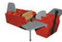
Flame red [2]