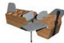
Olive wood decor [4]

Please add the selected colour code to the last digit of the Order No.