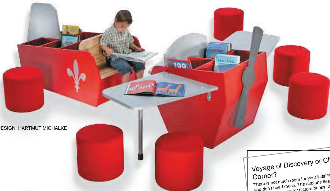
DESIGN HARTMUT MICHALKE

The plane can be placed free-standing and be randomly combined with supplementing accessories such as seat pillars or additional picture book boxes.