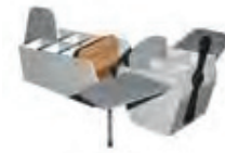
Traffic white [1]