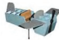
Ice blue [3]